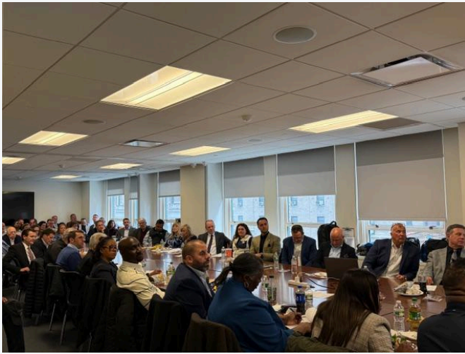
April meeting attendees