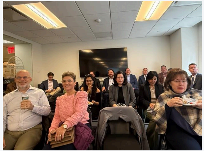
April meeting attendees