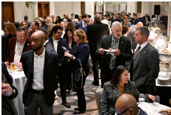
Reception attendees at the St. Regis Hotel.