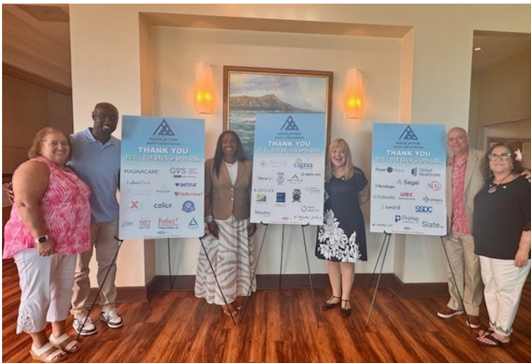
ABA brunch sponsor recognition during the IFEBP Annual Conference.