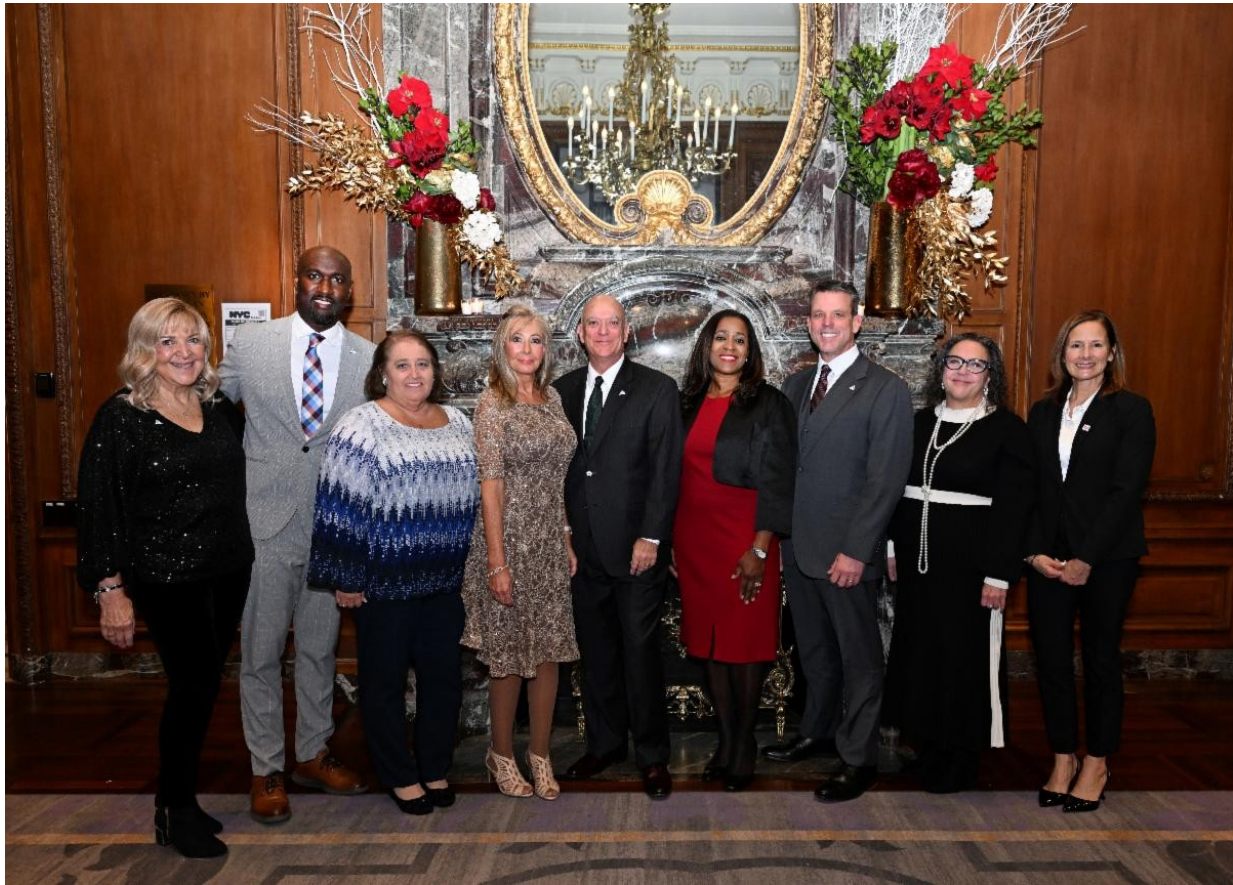
ABA Board and key staff.

The ABA Annual Reception was held at the St. Regis Hotel in New York City. Photos and highlights from the event are included below.