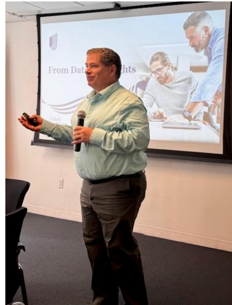
September meeting presentation.