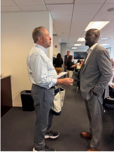
Networking prior to the meeting.