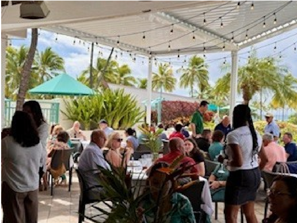
ABA members and guests gathered at Menenhune Grill in Honolulu.

In November, the ABA hosted a brunch, free to its members and guests, at Menenhune Grill in Honolulu to coincide with the opening of the IFEBP Annual Conference.