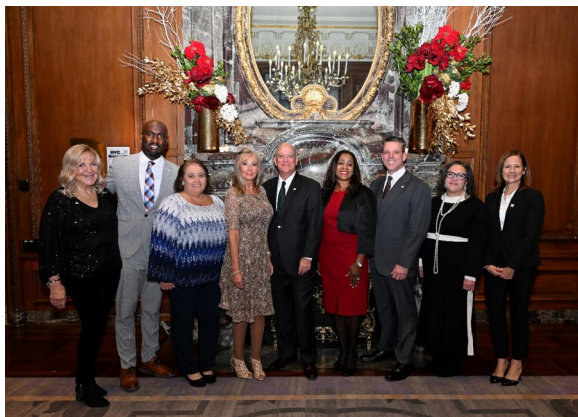
ABA Board and key staff.