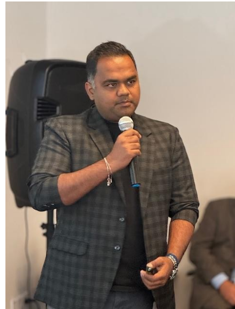
Presenter discussion during the September meeting.