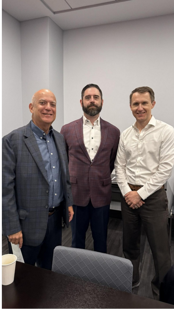
Roundtable discussion participants during the October breakfast meeting.