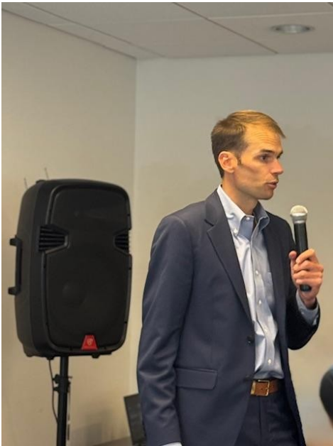
September meeting presentation.