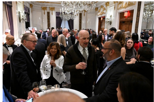
Reception attendees networking during the December event.