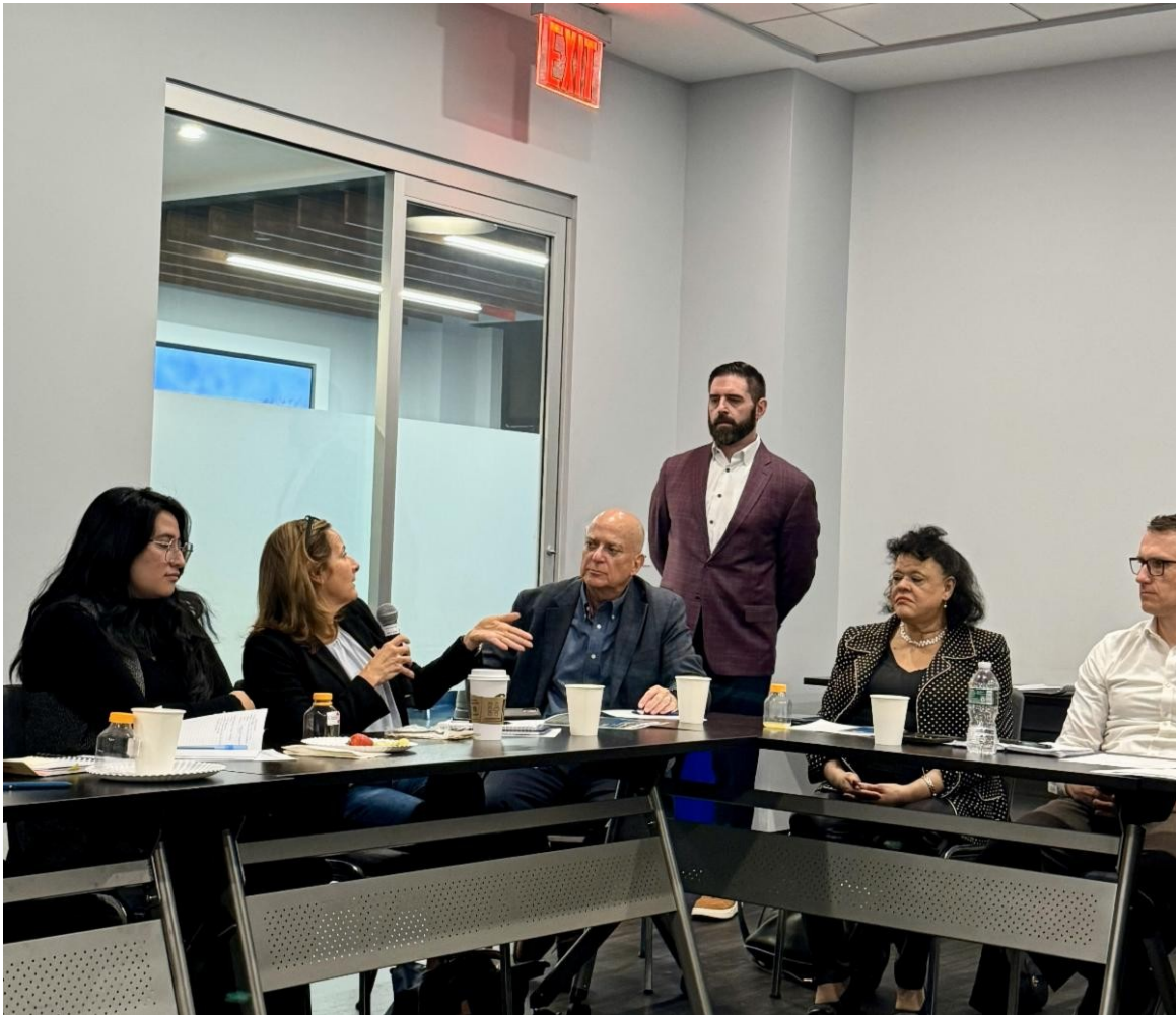
Meeting attendees at the September meeting.