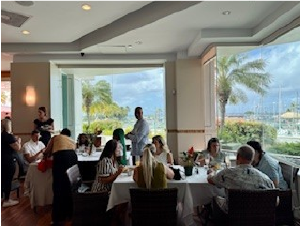
Members and guests enjoying the ABA brunch in Honolulu.